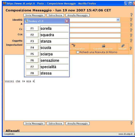
Figure 2: The User Interface.

The length of the suggestion list influences the time and the effort required to search and select the right word. In consequence, the user can customize the number of suggestions in a range of 1-10. We have limited the number of suggestions presented by Donkey to 10, since a user can notice at a glance a word appearing in a smaller list, rather than in a larger list. Indeed, the larger the list, the higher the level of concentration required to read all the suggestions.